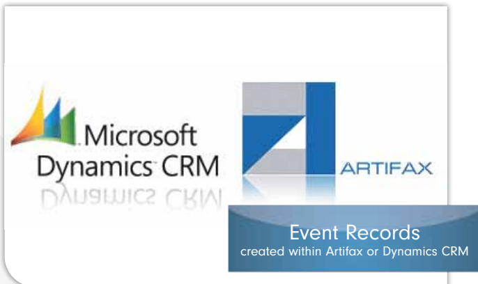
Event Records created within Artifax or Dynamics CRM

And because NAV is so flexible and 'open', we can integrate the system with your favourite event database e.g. Artifax or Dynamics CRM, in fact pretty much any system you choose to use.