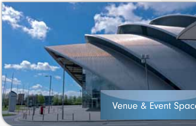
Venue & Event Space

Full integration with 3rd party solutions including Artifax, Dynamics CRM & ENTA. From a single screen, the event manager has an overview of all income and expenditure for each event with a full drill down to the underlying transactions. Payments to account e.g. to the promoter of a concert can be made immediately and with confidence.